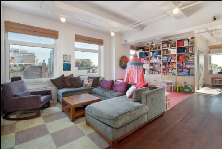
14 EAST 4 TH STREET NOHO/GREENWICH VILLAGE

NEW! Perched above NOHO, this renovated duplex features panoramic views and superb light from its north-east positioning through numerous large windows. Mint kitchen. Two full bedrooms and bathrooms. Fireplace. Condo. Doorman. $2.5m